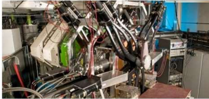
Figure 1: EMU Instrument

And here's a picture of The Cosener's House in Abingdon: