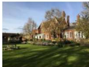
Figure 2: Cosener's House

And here's a picture of The Cosener's House in Abingdon: